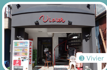
3 Vivier Local sake, Koshu wine, souvenirs. We are waiting for you with a variety of products. TEL : 042-684-2113