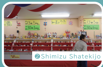
2 Shimizu Shatekijo Nostalgic shooting gallery. Easy to hit! fabulous prizes. TEL : 090-2650-4819