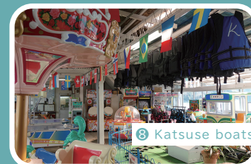
8 Katsuse boats Paddle out in a swan boat or soak in the nostalgia of the retro game arcade. TEL : 042-684-2131