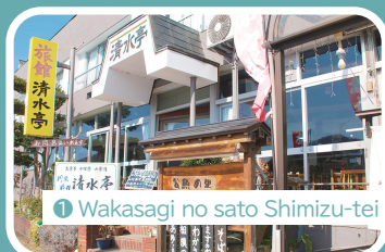
1 Wakasagi no sato Shimizu-tei Known for its freshwater fish and mountain veg. dishes. Provides overnight accommodation. TEL : 042-684-3311