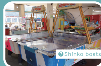
7 Shinko boats Witness the full extent of Lake Sagami's beauty by taking a tour on the whale boat. TEL : 042-684-2128