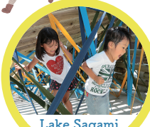
Lake Sagami Pleasure Forest

Ranked among Kanagawa's top scenic spots, a plus for mountain climbers.