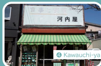
4 Kawauchi-ya Cheap, delicious with a varied menu, including soba noodles and rice bowls with various toppings. TEL : 042-684-4673