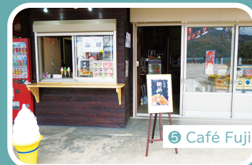
5 Café Fuji Full stars for the freshly fried curry breads. Soft serve ice-cream comes in a multitude of flavors. TEL : 042-684-2143