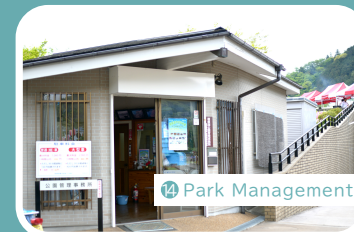
14 Park Management Many tourist pamphlets are available. Please drop in casually. TEL : 042-684-3276